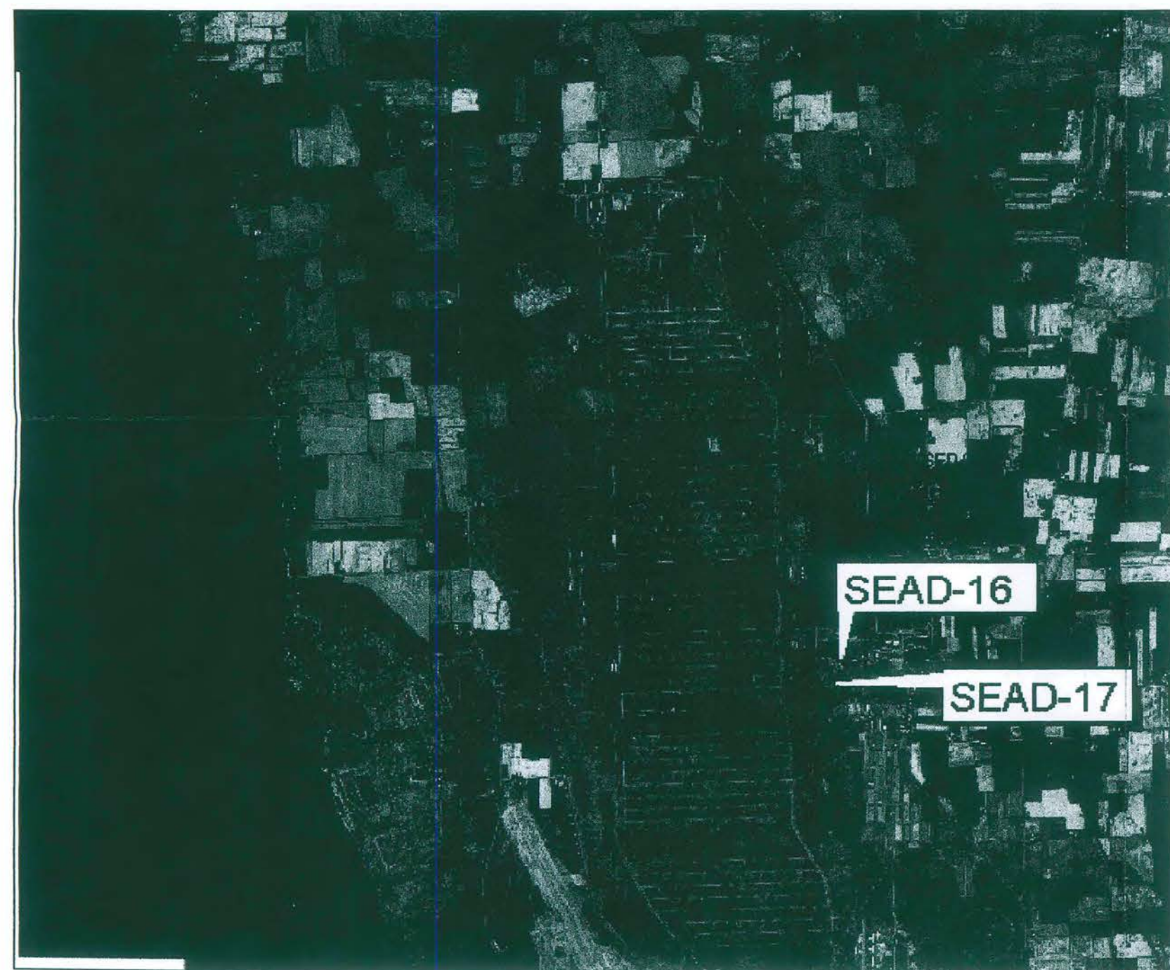
SITE PLAN NTS