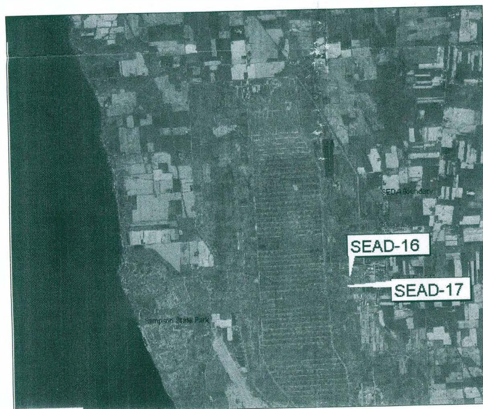
SITE PLAN NTS

I:\PTA\Projects\Seneca PBC\SEAD-16_17\Design WP\Report\Drawings\C-1.dwg