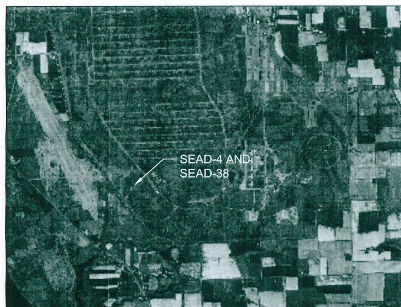
SITE PLAN NTS