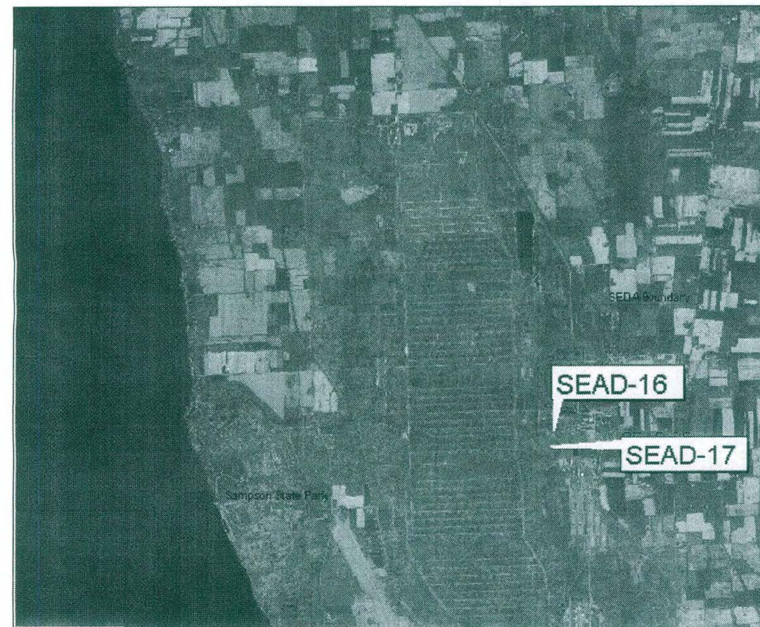
SITE PLAN NTS

P:\PIT\Projects\Seneca PBC\SEAD-16_17\Construction Completion Rpt\Draft\Figures\C-1.dwg