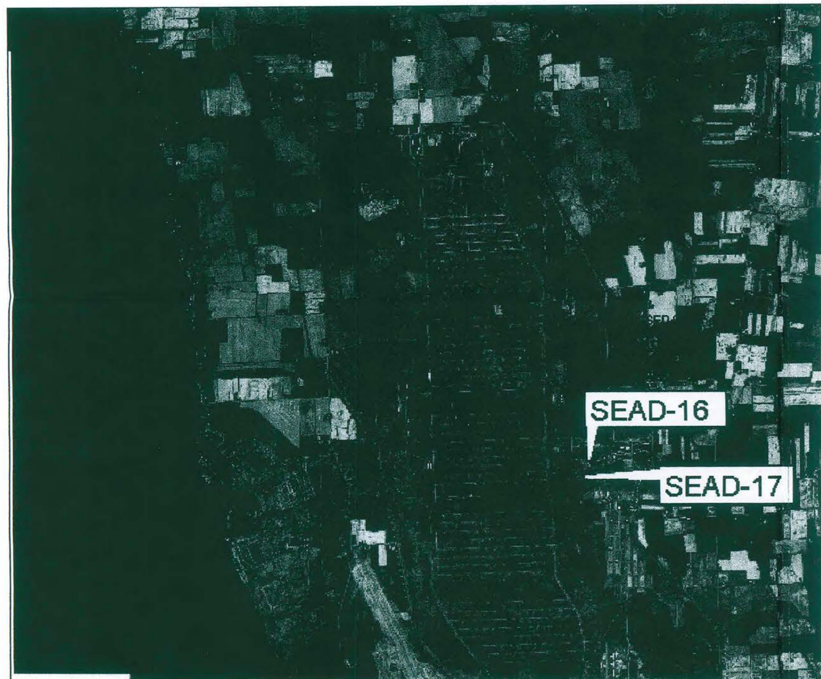
SITE PLAN NTS