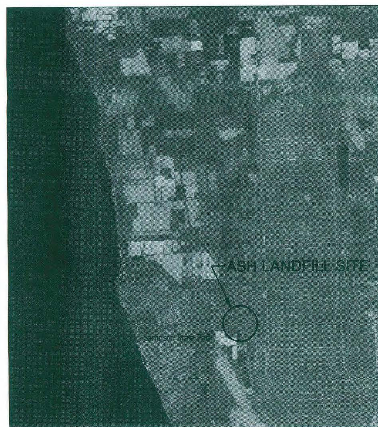
SITE PLAN NTS